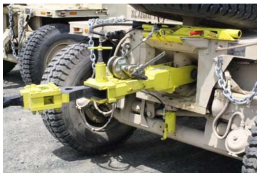
M989A1 TeleSwivel™ Lift Assist Kit (extended)