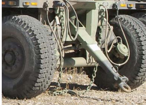
Current M989A1 trailer tow bar

2530 Meridian Pkwy. Suite 300 Research Triangle Park, NC 27713 (877) 480-0828